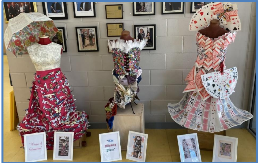
TY Junk Kouture Costumes 2023